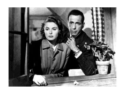
32. Future first - What London Watches: Ten Films That Shook Our World 6 Apr to 13 Apr 2017 Barbican Cinema Still from Casablanca