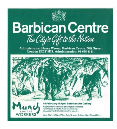
03. Munch and the Workers - 14 Feb to 8 Apr 1985

Barbican Art Gallery Barbican Centre brochure (Feb 1985)