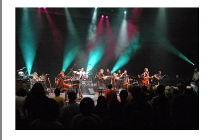
Brazilian Culture - 13 Feb to 22 May 2006 Barbican Hall Os Mutantes, 22 May 2006