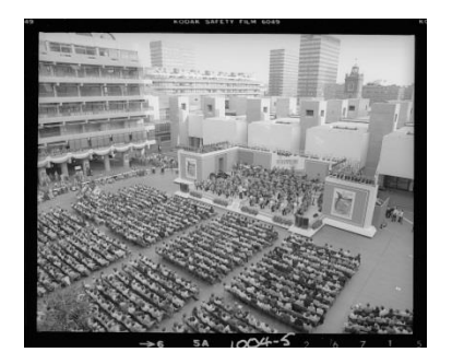
34. Future first - Silent Symphony - LSO 2017–18 Opening Concert Live Relay - 14 Sep 2017 The LSO performing on the Sculpture Court in 1982 (which the silent symphony concert will evoke).