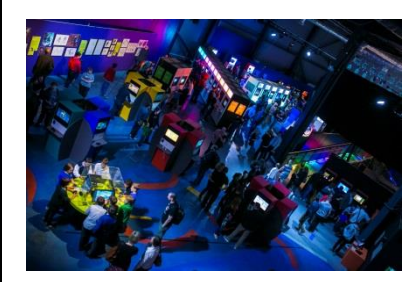
2002 Barbican International Enterprises Game On 2.0, installation shot at the Life Science Centre, Newcastle.