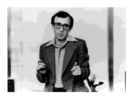
02. Woody Allen Retrospective - 9 Nov to 30 Nov 1984

Panoramic view from above of the Barbican Centre (Feb 1982)