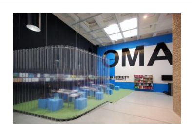
21. OMA/Progress - 6 Oct 2011 to 19 Feb 2012 Barbican Art Gallery