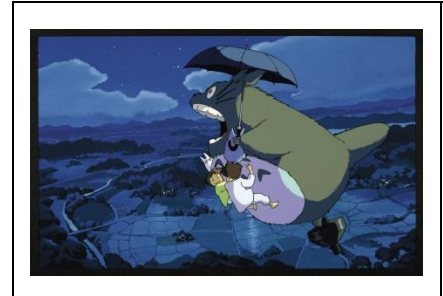
11. Studio Ghibli season - 19 Oct to 11 Nov 2001 Barbican Cinema Still from My Neighbor Totoro (Tonari no Totoro)