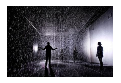
24. Random International: Rain Room - 4 Oct 2012 to 3 Mar 2013 The Curve, Barbican Art Gallery