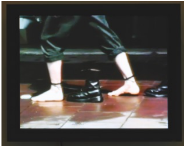
Mona Hatoum Roadworks , 1985 Documentation of performance, Brixton, London

© Mona Hatoum. Photo © White Cube (Kitmin Lee)