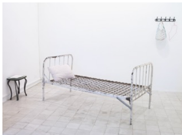
Mona Hatoum Interior Landscape , 2008 Steel bed, pillow, human hair, table, cardboard tray, cut-up map, metal rack and wire hanger Dimensions variable

© Mona Hatoum.