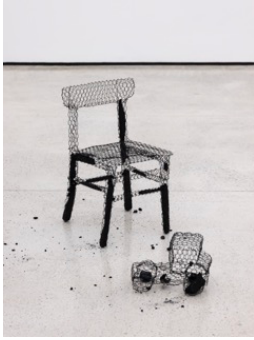
Mona Hatoum Remains of the Day , 2016-2018

© Mona Hatoum.