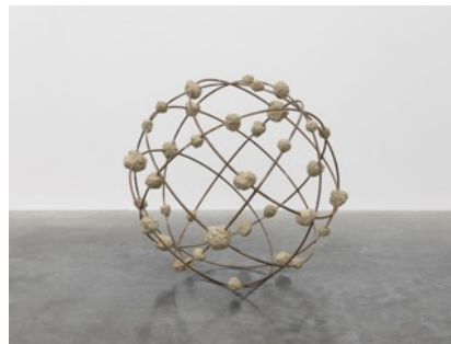
Mona Hatoum Orbital , 2018 Concrete and steel reinforcement bars 140 cm diameter

© Mona Hatoum.