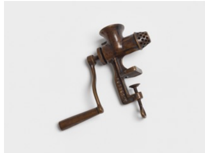
Mona Hatoum Untitled (meat grinder) , 2005

© Mona Hatoum. Courtesy Kunstmuseum St. Gallen (Photo: Stefan Rohner)