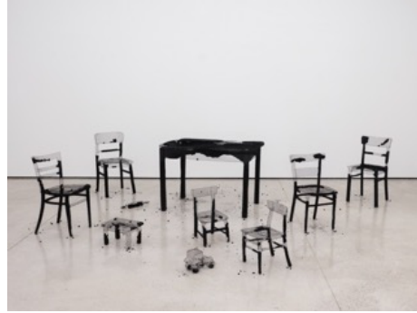
Mona Hatoum Remains of the Day , 2016-2018

© Mona Hatoum.