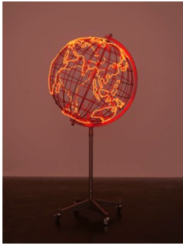
Mona Hatoum Hot Spot (stand) , 2018 Stainless steel, neon tube and rubber 172 x 83 x 80 cm

© Mona Hatoum.