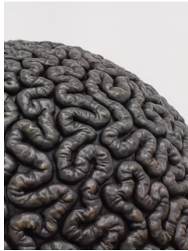
Mona Hatoum Inside Out , 2019 Bronze 103 cm diameter

© Mona Hatoum.