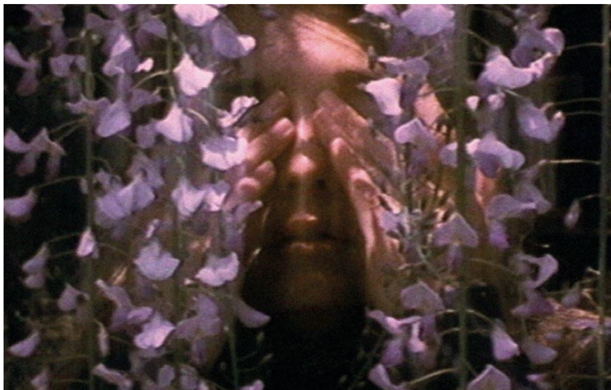
Dyketactics (1974).