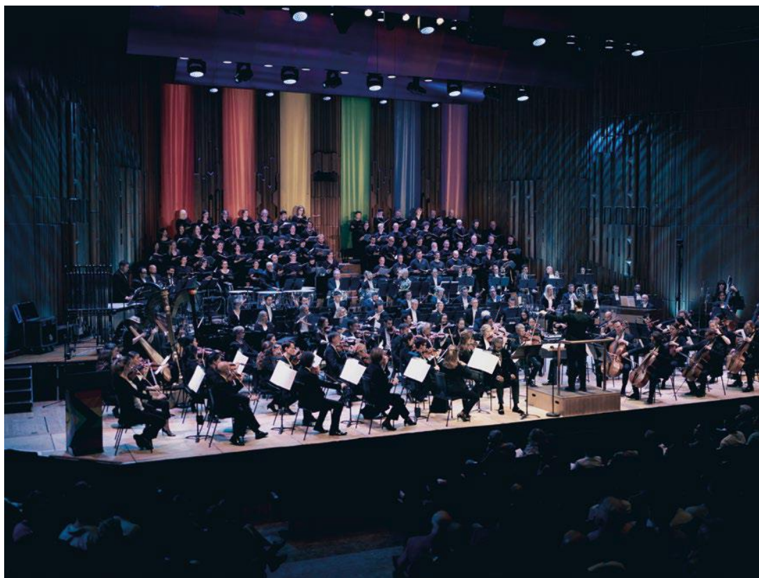
The LSO will perform at a centrepiece concert for Classical Pride