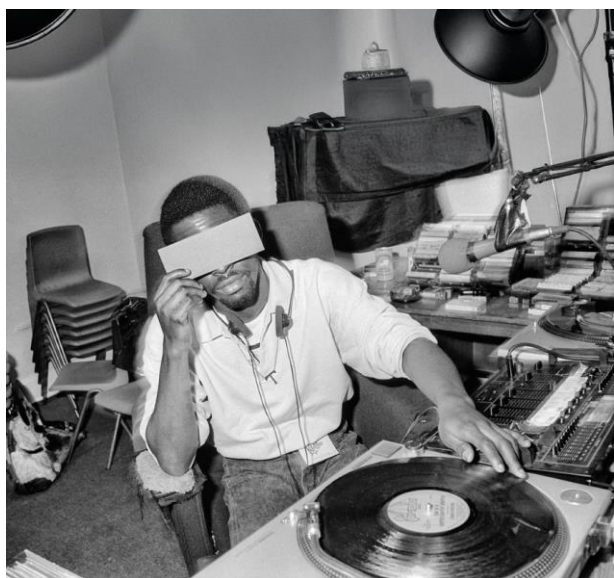
Pirate radio station pioneers Kiss FM studios, 13 November 1987