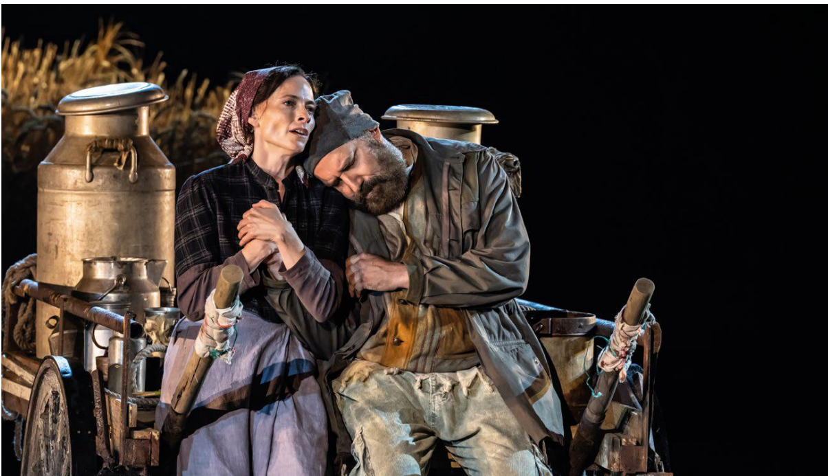
Fiddler on the Roof