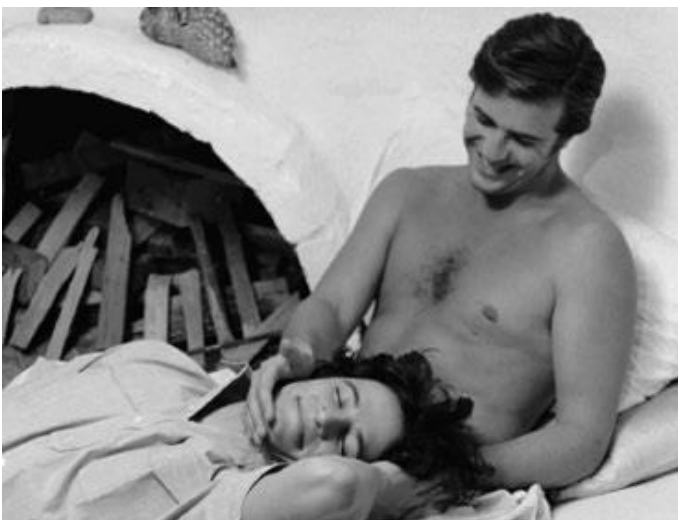
The Set (1970) © Frank Brittain

*There's always an asterisk. In this case, there are a few exceptions – check the website for details.