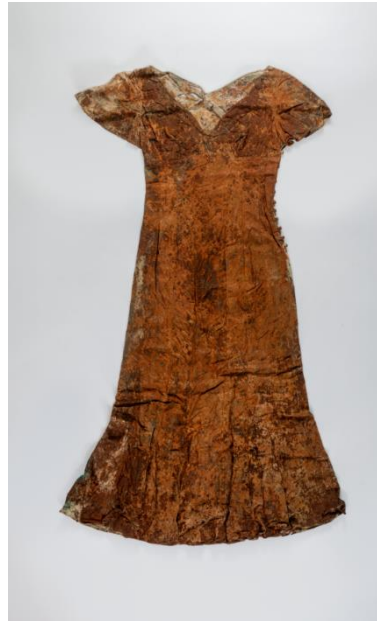
4. Dirty Looks Hussein Chalayan, Autumn/Winter 1994 Cartesia .