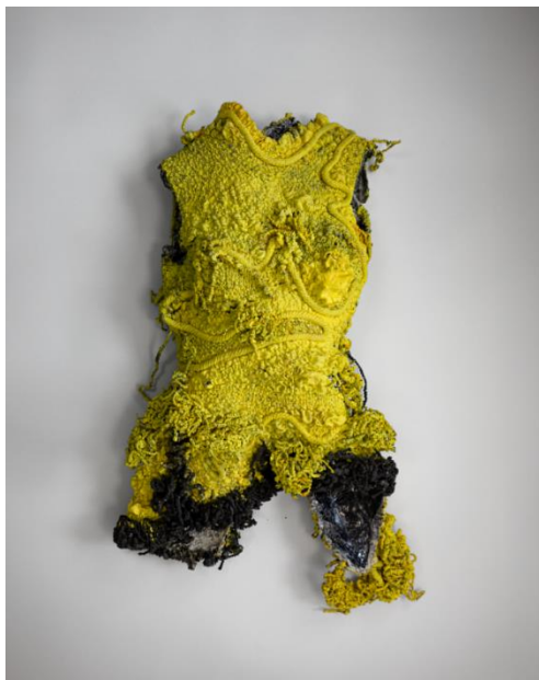
3. Dirty Looks Piero D'Angelo, Physarum Lab .