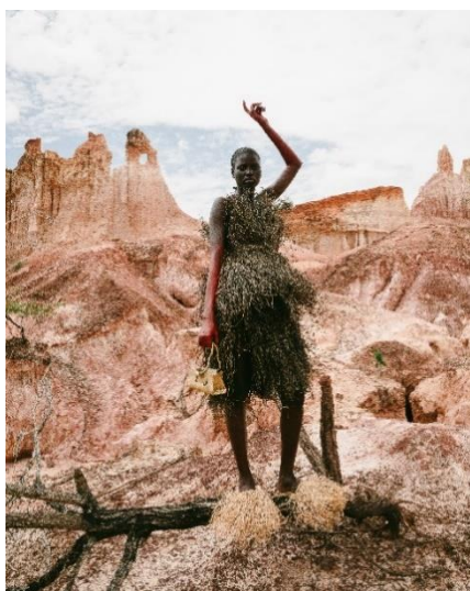
5. Dirty Looks IAMISIGO, handwoven raffia-cotton blend look dyed with coffee and mud, Spring/Summer 2024 Shadows .