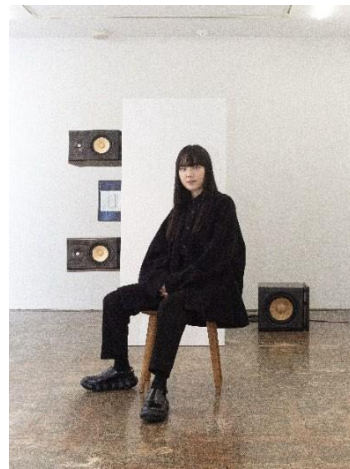
2. Observatory Station Miyu Hosoi, Observatory Station , 2025