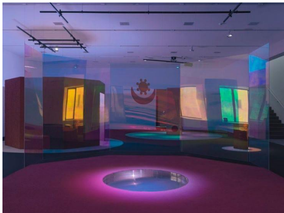
3. Resonant Frequencies Evan Ifekoya, Rhymic Medicine as part of The Central Sun , 2022. © Evan Ifekoya. All rights reserved, DACS 2025.