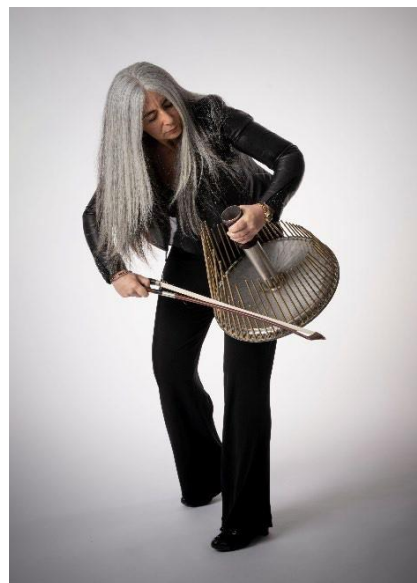
4. Embodied Listening Playground