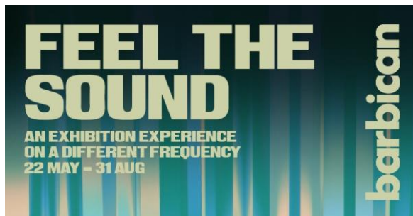
1. Feel the Sound Exhibition graphic HATO

PLEASE CONTACT THE PRESS TEAM (DETAILS BELOW) FOR HIGH-RES COPIES