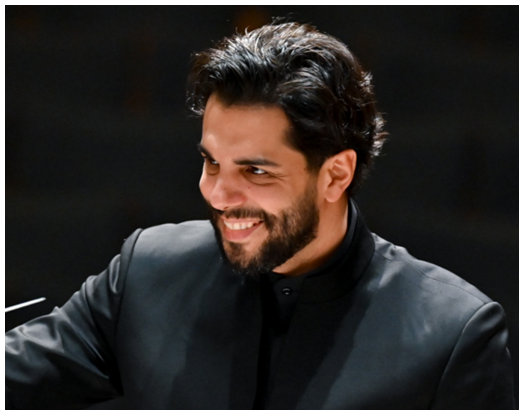
Royal Liverpool Philharmonic/Hindoyan Mon 19 May, Hall