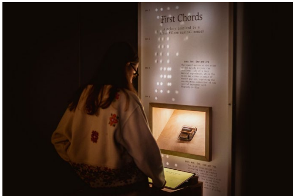
11. Forever Frequencies Domestic Data Streamers, Forever Frequencies , 2025, installation prototype courtesy of the artist