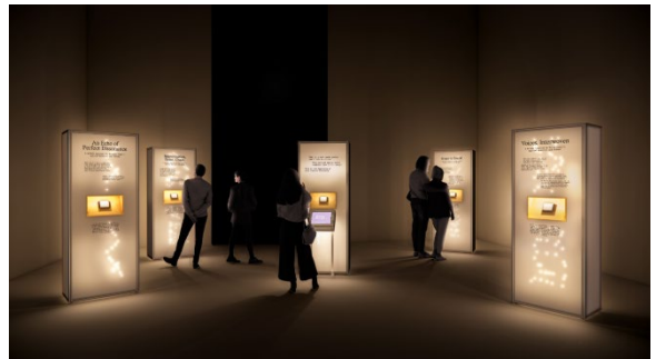
12. Forever Frequencies Domestic Data Streamers, Forever Frequencies , 2025, installation render