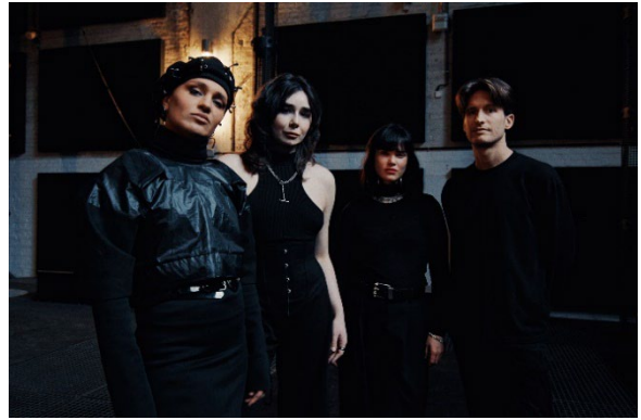
10. UN/BOUND TRANS VOICES, ILĀ & MONOM, with contribution from Patty Ayukawa, UN/BOUND , 2025