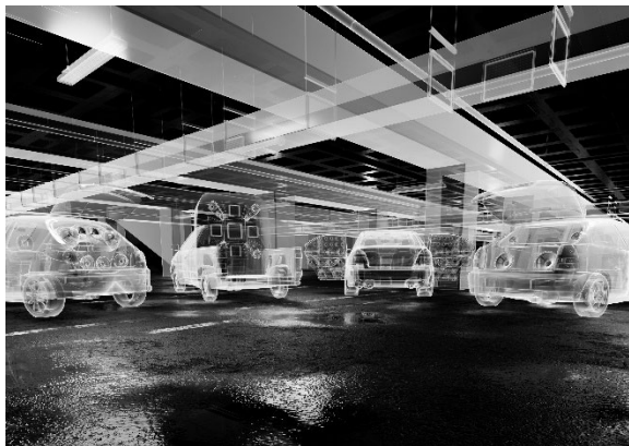
13. Joyride Temporary Pleasure, Joyride , 2025, concept image courtesy of the artist