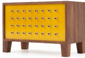
9. Sonic Listening Playground Yuri Suzuki, The Ambient Machine , 2022