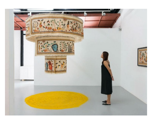
Credit: Citra Sasmita, Installation view, Ode to the Sun, Singapore, 2020.

Join Lotte Johnson for a Curator's Tour ahead of the wider opening of Citra Sasmita's first solo UK exhibition in The Curve. Via Indonesian Kamasan painting, installation, embroidery and scent, we'll embark on a sensory journey exploring ancestral memory, ritual and migration.