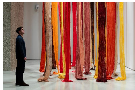
14. Unravel: The Power and Politics of Textiles in Art, Installation view Barbican Art Gallery 13 Feb – 26 May 2024 © Jemima Yong / Barbican Art Gallery

13. Unravel: The Power and Politics of Textiles in Art, Installation view Barbican Art Gallery 13 Feb – 26 May 2024 © Jemima Yong / Barbican Art Gallery