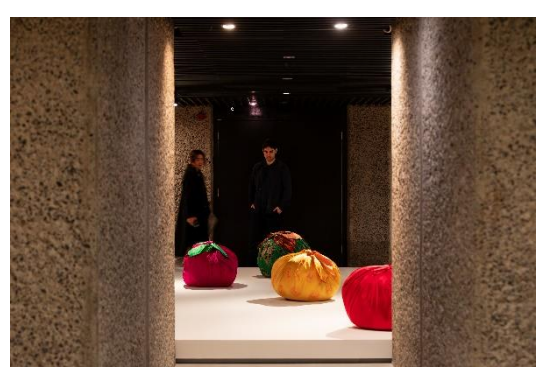
20. Unravel: The Power and Politics of Textiles in Art, Installation view Barbican Art Gallery 13 Feb – 26 May 2024 © Jemima Yong / Barbican Art Gallery

21. Unravel: The Power and Politics of Textiles in Art, Installation view Barbican Art Gallery 13 Feb – 26 May 2024 © Jemima Yong / Barbican Art Gallery