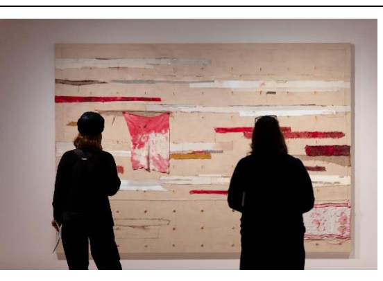
Unravel: The Power and Politics of Textiles in Art, Installation view Barbican Art Gallery 13 Feb – 26 May 2024 © Jemima Yong / Barbican Art Gallery

5. Unravel: The Power and Politics of Textiles in Art, Installation view Barbican Art Gallery 13 Feb – 26 May 2024 © Jemima Yong / Barbican Art Gallery