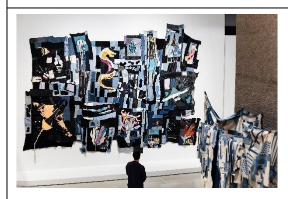
9. Unravel: The Power and Politics of Textiles in Art, Installation view Barbican Art Gallery 13 Feb – 26 May 2024 © Jemima Yong / Barbican Art Gallery

8. Unravel: The Power and Politics of Textiles in Art, Installation view Barbican Art Gallery 13 Feb – 26 May 2024 © Jemima Yong / Barbican Art Gallery