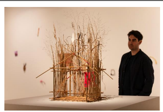
Unravel: The Power and Politics of Textiles in Art, Installation view Barbican Art Gallery Feb – 26 May 2024

Unravel: The Power and Politics of Textiles in Art, Installation view Barbican Art Gallery Feb – 26 May 2024