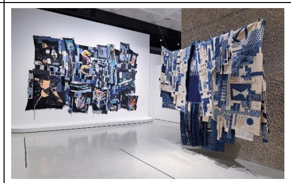
Unravel: The Power and Politics of Textiles in Art, Installation view Barbican Art Gallery Feb – 26 May 2024