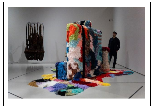
Unravel: The Power and Politics of Textiles in Art, Installation view Barbican Art Gallery Feb – 26 May 2024