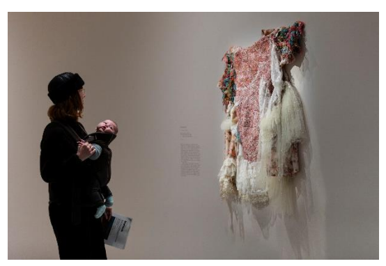
Unravel: The Power and Politics of Textiles in Art, Installation view Barbican Art Gallery Feb – 26 May 2024