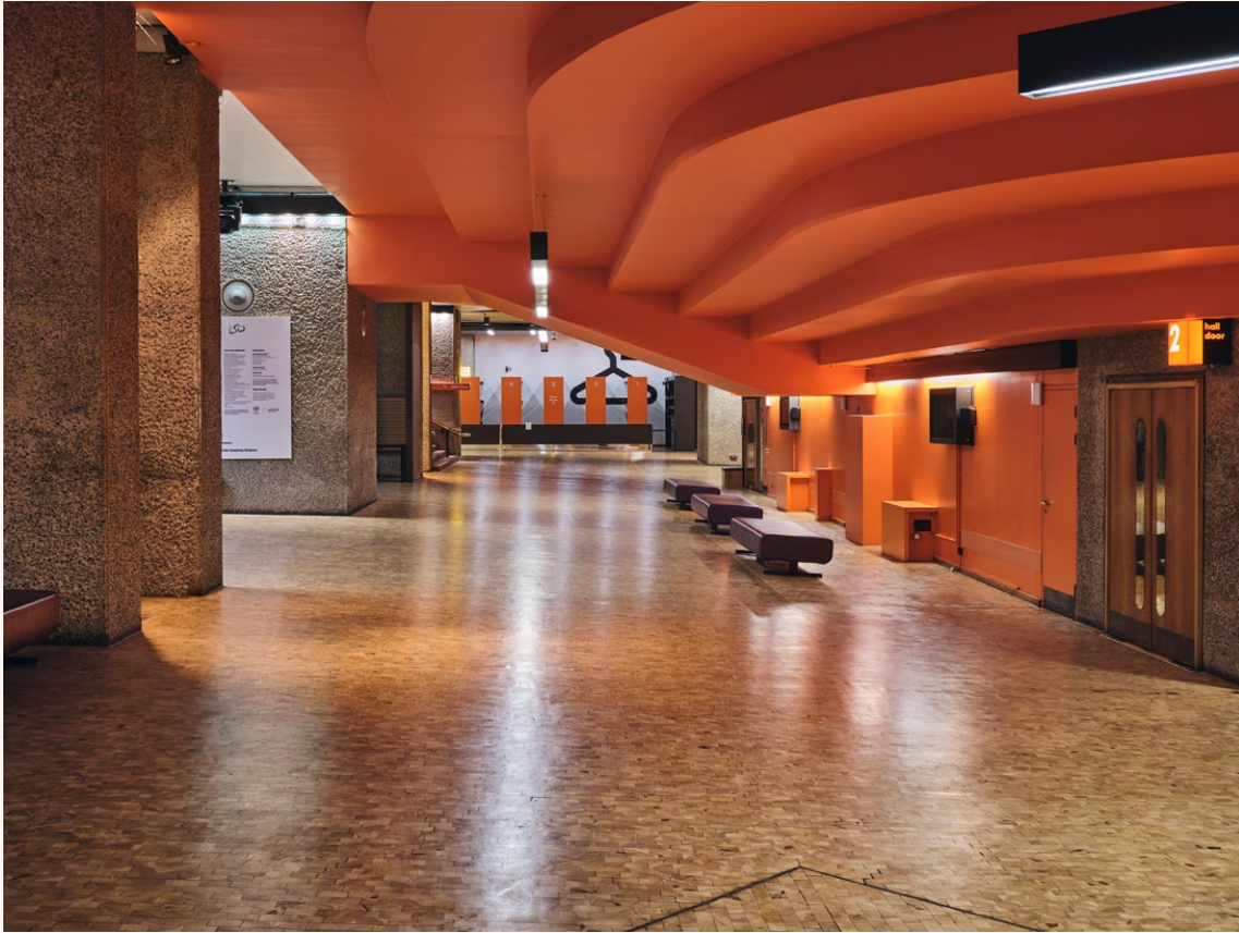
Level -1 Foyer