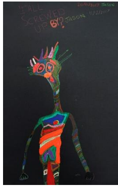
7. I All Screwed Up (original drawing) © Jason Ferry differently various , Barbican Centre, 2023 Courtesy of the artist and Headway East London