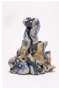
9. Neural Reefs © Terrance Barr differently various , Barbican Centre, 2023