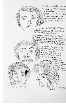
8. Self-Portrait © Sam Jevon differently various , Barbican Centre, 2023