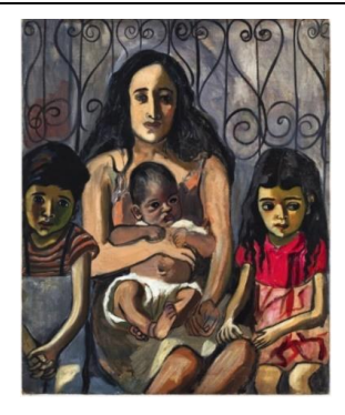
Alice Neel The Spanish Family, 1943