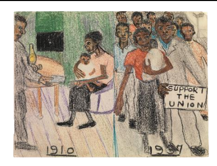
Alice Neel Support the Union, 1937