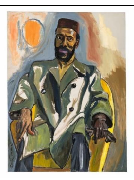
10. Alice Neel Abdul Rahman, 1964 © The Estate of Alice Neel. Courtesy The Estate of Alice Neel.