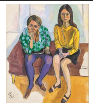
11. Alice Neel Wellesley Girls, 1967 © The Estate of Alice Neel. Courtesy The Estate of Alice Neel.