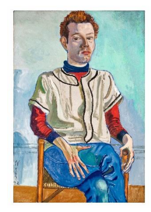
15. Alice Neel Jackie Curtis as a Boy, 1972 © The Estate of Alice Neel. Courtesy The Estate of Alice Neel