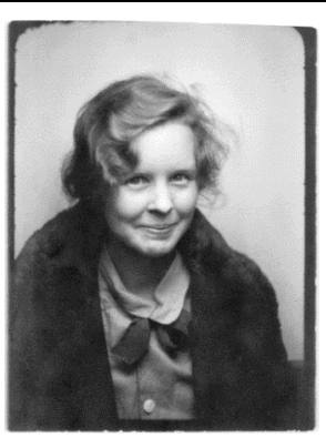
Alice Neel Alice Neel at the age of 29, 1929