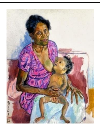
19. Alice Neel Carmen and Judy, 1972 © The Estate of Alice Neel. Courtesy The Estate of Alice Neel.