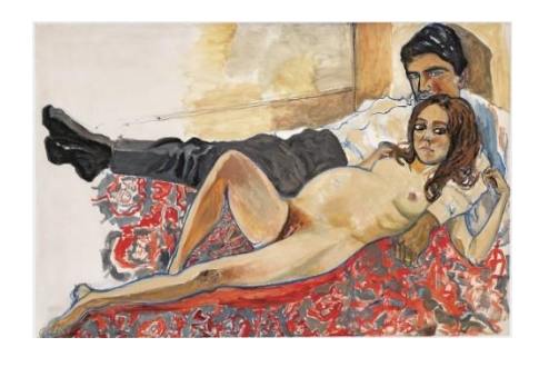
12. Alice Neel Pregnant Julie and Algis, 1967 © The Estate of Alice Neel. Courtesy The Estate of Alice Neel.