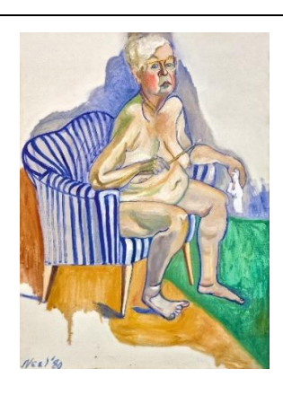
22. Alice Neel Self-Portrait, 1980