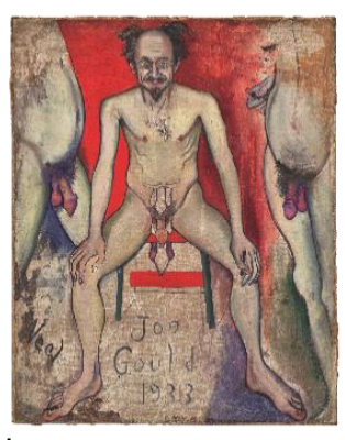
Alice Neel Joe Gould, 1933 © The Estate of Alice Neel. Courtesy The Estate of Alice Neel.