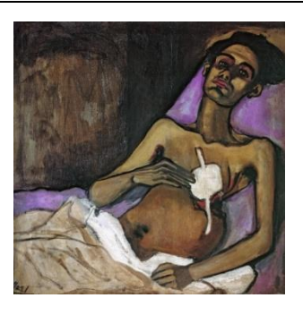
Alice Neel T.B. Harlem, 1940