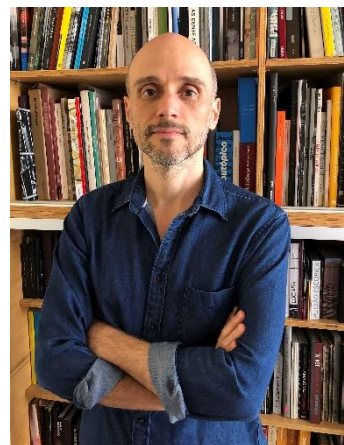
12. Thyago Nogueira, 2019. © Thyago Nogueira