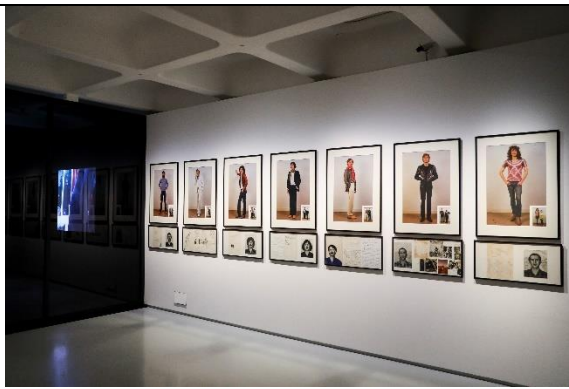
31. Masculinities : Liberation through Photography Installation view Barbican Art Gallery 13 July 2020 – 23 August 2020