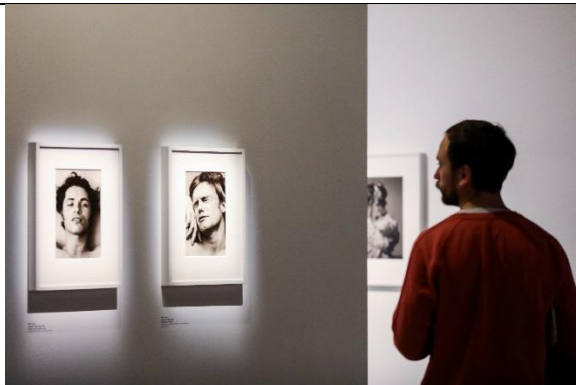
23. Masculinities : Liberation through Photography Installation view Barbican Art Gallery 13 July 2020 – 23 August 2020