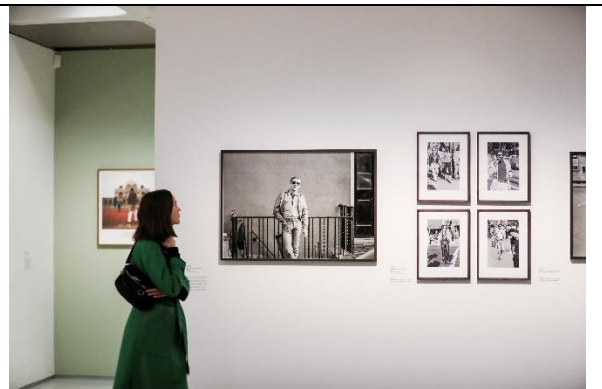
26. Masculinities : Liberation through Photography Installation view Barbican Art Gallery 13 July 2020 – 23 August 2020