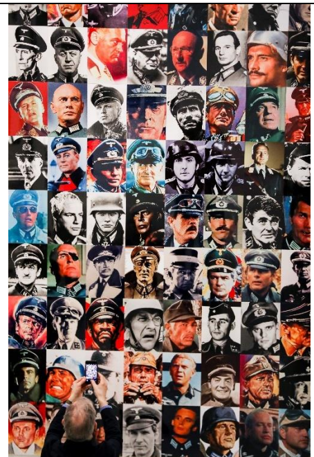
14. Masculinities : Liberation through Photography Installation view Barbican Art Gallery 13 July 2020 – 23 August 2020