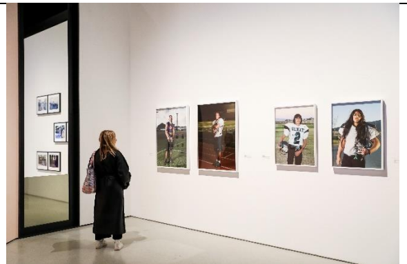
6. Masculinities : Liberation through Photography Installation view Barbican Art Gallery 13 July 2020 – 23 August 2020