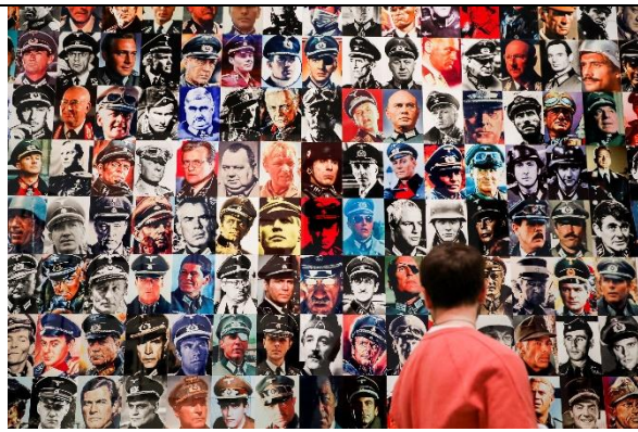
13. Masculinities : Liberation through Photography Installation view Barbican Art Gallery 13 July 2020 – 23 August 2020