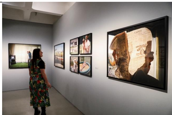
17. Masculinities : Liberation through Photography Installation view Barbican Art Gallery 13 July 2020 – 23 August 2020