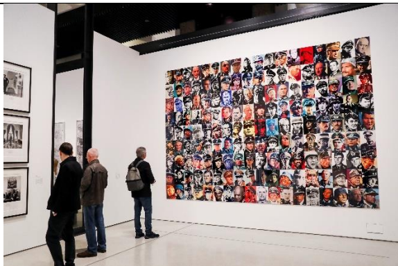
11. Masculinities : Liberation through Photography Installation view Barbican Art Gallery 13 July 2020 – 23 August 2020