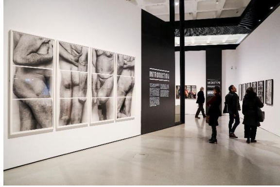
1. Masculinities : Liberation through Photography Installation view Barbican Art Gallery 13 July 2020 – 23 August 2020

Please contact the press office for high res copies – details below