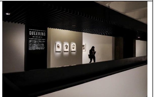
22. Masculinities : Liberation through Photography Installation view Barbican Art Gallery 13 July 2020 – 23 August 2020