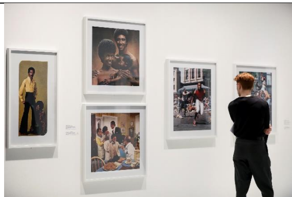
29. Masculinities : Liberation through Photography Installation view Barbican Art Gallery 13 July 2020 – 23 August 2020