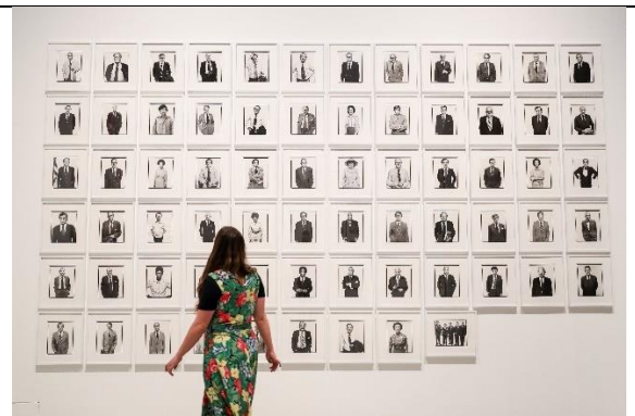
16. Masculinities : Liberation through Photography Installation view Barbican Art Gallery 13 July 2020 – 23 August 2020