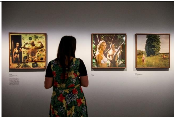
21. Masculinities : Liberation through Photography Installation view Barbican Art Gallery 13 July 2020 – 23 August 2020