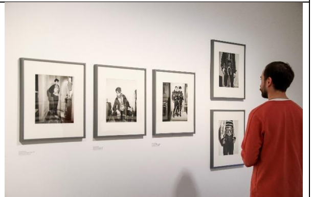
24. Masculinities : Liberation through Photography Installation view Barbican Art Gallery 13 July 2020 – 23 August 2020