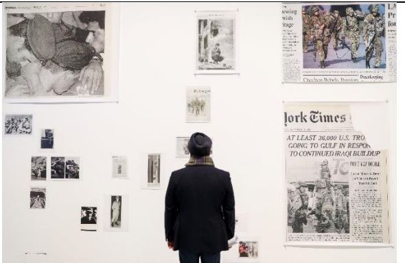
4. Masculinities : Liberation through Photography Installation view Barbican Art Gallery 13 July 2020 – 23 August 2020