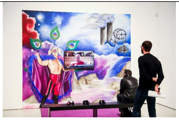
8. Masculinities : Liberation through Photography Installation view Barbican Art Gallery 13 July 2020 – 23 August 2020