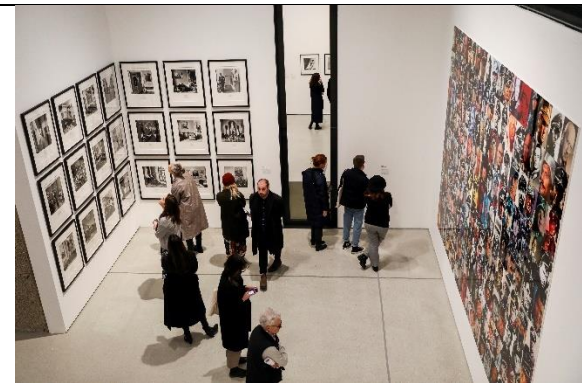
12. Masculinities : Liberation through Photography Installation view Barbican Art Gallery 13 July 2020 – 23 August 2020