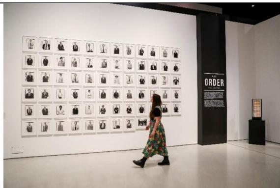
15. Masculinities : Liberation through Photography Installation view Barbican Art Gallery 13 July 2020 – 23 August 2020