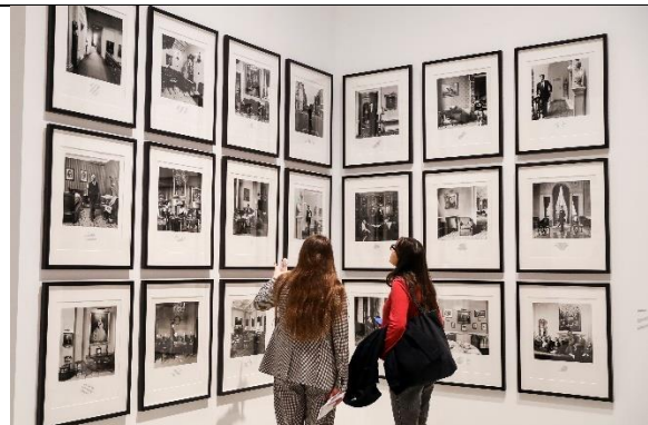
10. Masculinities : Liberation through Photography Installation view Barbican Art Gallery 13 July 2020 – 23 August 2020