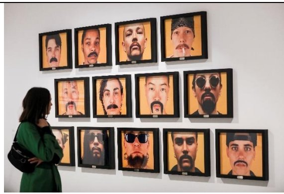
25. Masculinities : Liberation through Photography Installation view Barbican Art Gallery 13 July 2020 – 23 August 2020