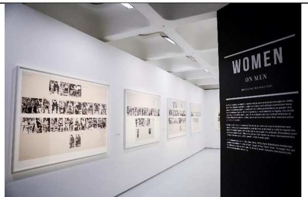
30. Masculinities : Liberation through Photography Installation view Barbican Art Gallery 13 July 2020 – 23 August 2020