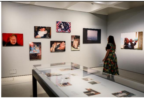
19. Masculinities : Liberation through Photography Installation view Barbican Art Gallery 13 July 2020 – 23 August 2020