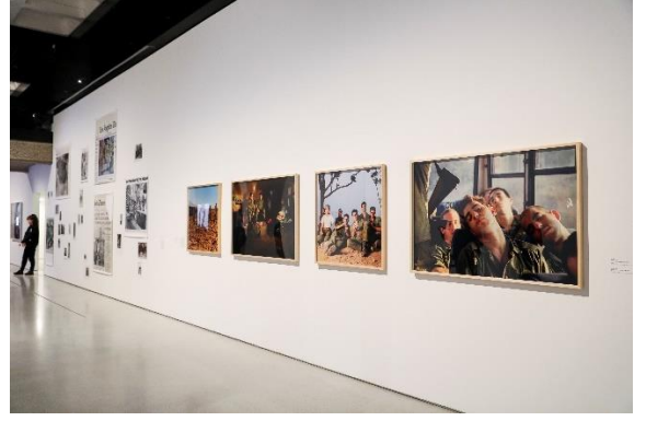
2. Masculinities : Liberation through Photography Installation view Barbican Art Gallery 13 July 2020 – 23 August 2020