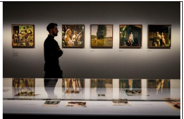
20. Masculinities : Liberation through Photography Installation view Barbican Art Gallery 13 July 2020 – 23 August 2020