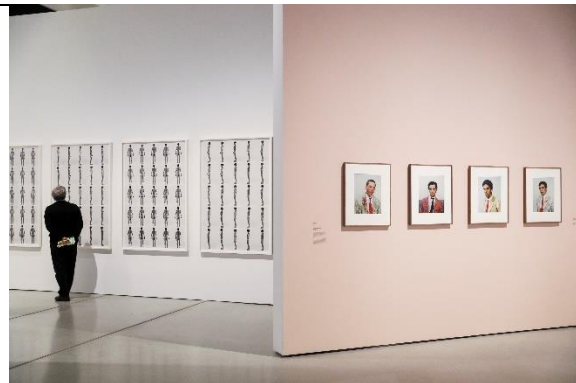
5. Masculinities : Liberation through Photography Installation view Barbican Art Gallery 13 July 2020 – 23 August 2020