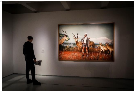
27. Masculinities : Liberation through Photography Installation view Barbican Art Gallery 13 July 2020 – 23 August 2020