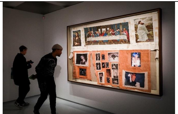
28. Masculinities : Liberation through Photography Installation view Barbican Art Gallery 13 July 2020 – 23 August 2020