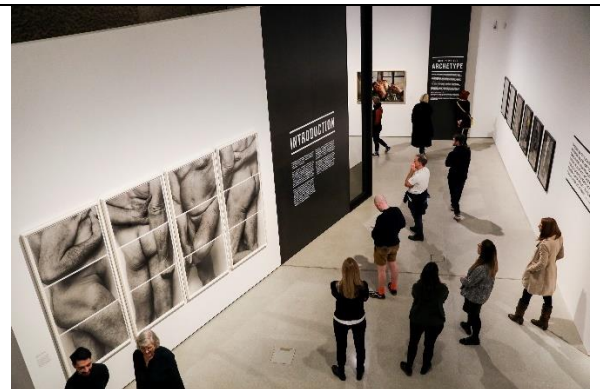
32. Masculinities : Liberation through Photography Installation view Barbican Art Gallery 13 July 2020 – 23 August 2020