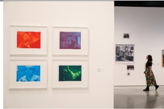
3. Masculinities : Liberation through Photography Installation view Barbican Art Gallery 13 July 2020 – 23 August 2020