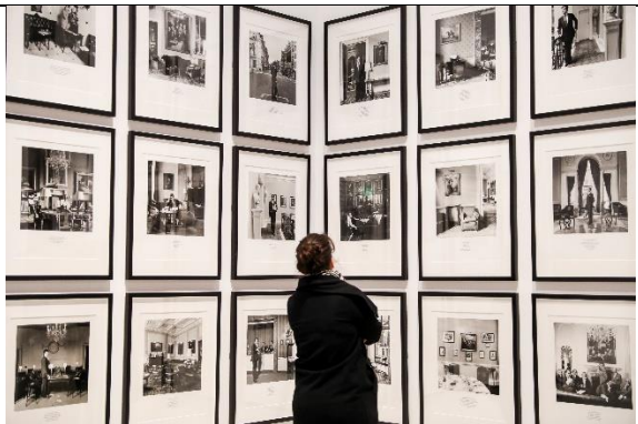
9. Masculinities : Liberation through Photography Installation view Barbican Art Gallery 13 July 2020 – 23 August 2020