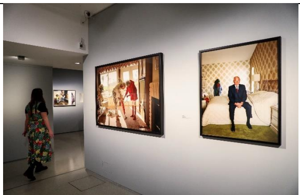
18. Masculinities : Liberation through Photography Installation view Barbican Art Gallery 13 July 2020 – 23 August 2020