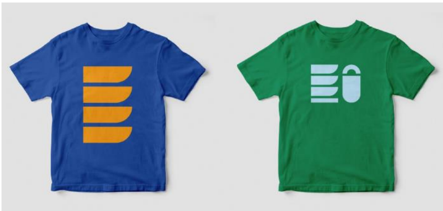
Shapes T-shirt, £20.00

Double-sided design available in blue and green colour schemes; 100% organic cotton, silk-screen printing; Bag dimensions: 44cm x 38cm