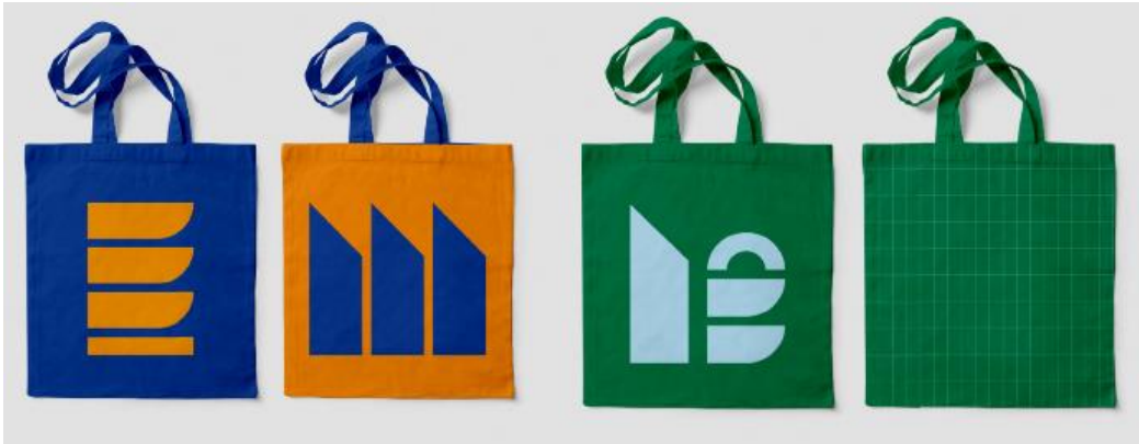
Shapes Tote Bag, £12.00

The Shapes collection has been created exclusively for the Barbican by Istanbul based Reflect Studio. Inspired by the brutalist architecture of the Barbican estate, Reflect have distilled its most iconic features to simple, bold shapes in lush and playful colours. Reflect put sustainability at the core of their business, working with fair trade production partners and using eco-friendly and long-lasting materials.