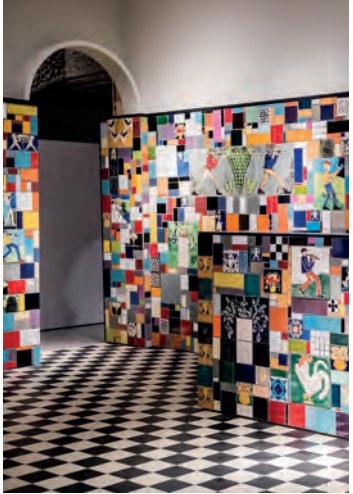
Into the Night_Cabarets and Clubs in Modern Art, Barbican Art Gallery