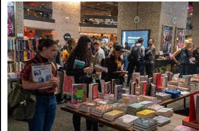
29. New Suns: A Feminist Literary Festival New Suns on Level G of the Barbican Centre, October 2019