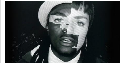
39. Alternate Realities Echo , by Georgie Pinn