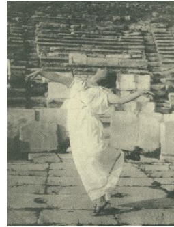
03. Viviana Durante Company – Isadora Now Isadora Duncan dancing in the Theatre of Dionysus by Raymond Duncan (1903)