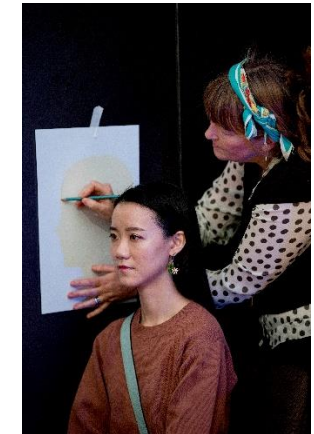
30. OpenFest OpenFest, February 2019