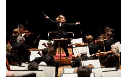
05. Beethoven 250 City of Birmingham Symphony Orchestra and Mirga Gražinytė-Tyla