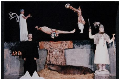
31. Out in the Shadows: Queer expression under times of cinema censorship The Color of Pomegranates (Directed by Sergei Parajanov, USSR, 1969)