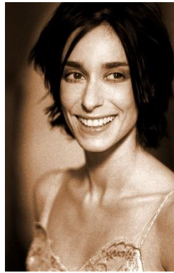
32. Viviana Durante Company – Isadora Now Viviana Durante