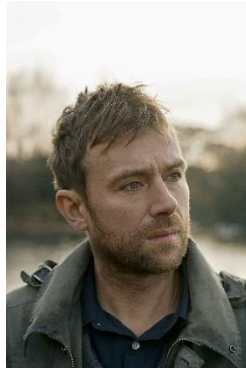
02. Damon Albarn: The Nearer the Fountain, More Pure the Stream Flows Damon Albarn