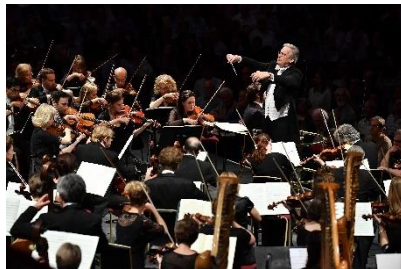
07. Beethoven 250 Orchestre Révolutionnaire et Romantique and Sir John Eliot Gardiner