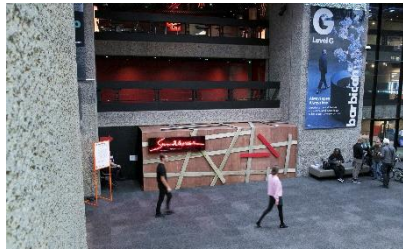
27. Soundhouse In the Dark and Falling Tree Productions CREDIT: Suzanne Zhang