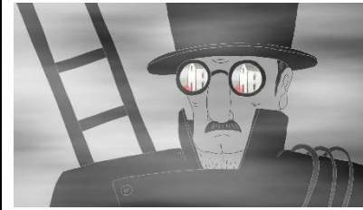
24. London International Animation Festival: Inside the Mind House of Unconsciousness (Directed by Preet Tender, Estonia, 2015)