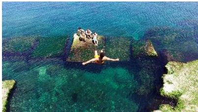
36. Out in the Shadows: Queer expression under times of cinema censorship Martyr (Directed by Mazen Khaled, Lebanon, 2017)