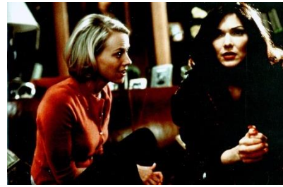
23. Autism and Cinema: An exploration of Neurodiversity Mulholland Drive (Directed by David Lynch, US, 2001)