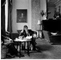
11. Masculinities: Liberation through Photography