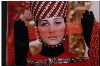
37. Out in the Shadows: Queer expression under times of cinema censorship The Color of Pomegranates (Directed by Sergei Parajanov, USSR, 1969)