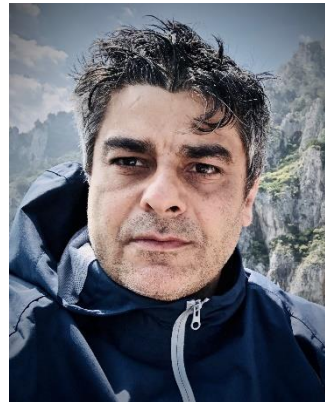
38. Alternate Realities Agostino Ferrente