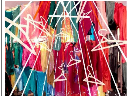
40. Alternate Realities Through the Wardrobe , by Rob Eagle