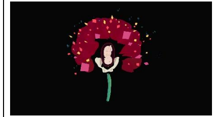
25. London International Animation Festival: Inside the Mind Coda (Directed by Alan Holly, UK, 2014)