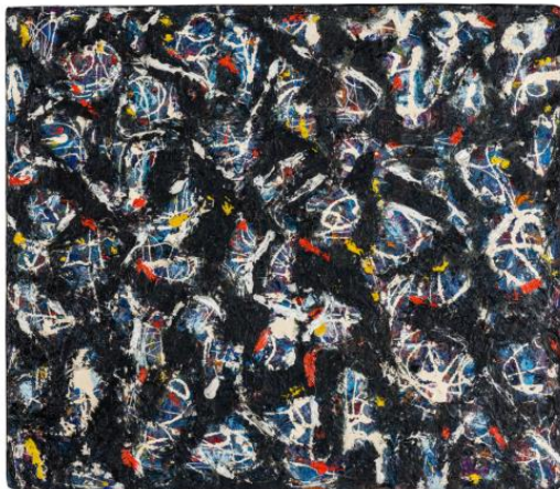
3. Lee Krasner