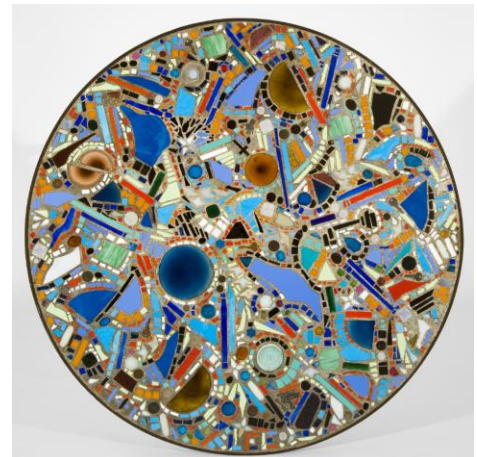
4. Lee Krasner