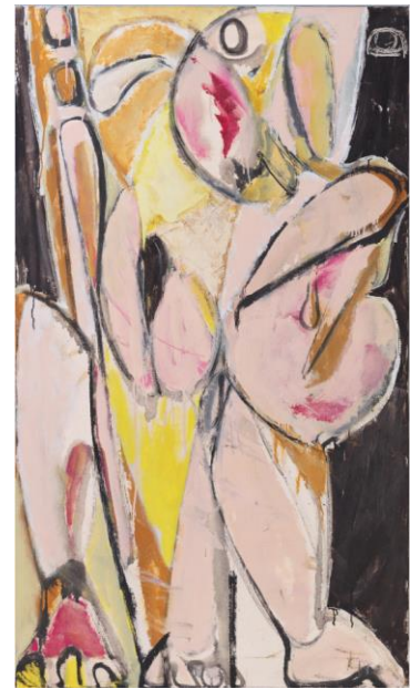
8. Lee Krasner Prophecy , 1956 Private Collection.