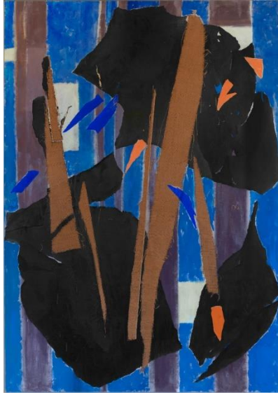
5. Lee Krasner Blue Level , 1955 Private Collection. © The Pollock-Krasner Foundation.