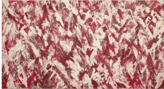
11. Lee Krasner Another Storm , 1963 Private Collection.