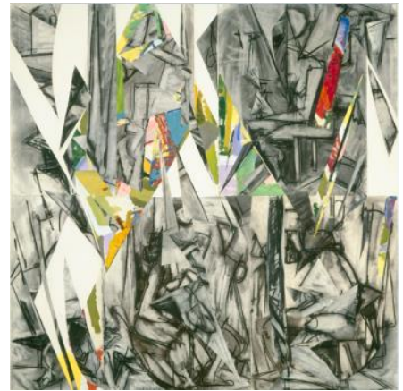
16. Lee Krasner Imperative , 1976 National Gallery of Art, Washington D.C. © The Pollock-Krasner Foundation. Courtesy National Gallery of Art, Washington D.C.