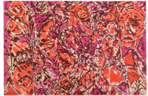
12. Lee Krasner Icarus , 1964 Thomson Family Collection, New York. © The Pollock-Krasner Foundation. Courtesy Kasmin Gallery, New York. Photograph by Diego Flores.