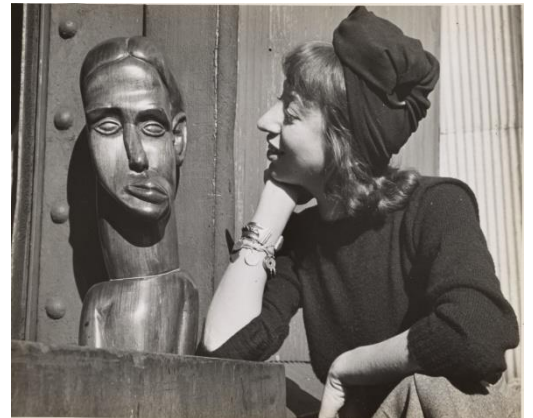
18. Lee Krasner at the WPA Pier, New York City, where she was working on a WPA commission, c. 1940.