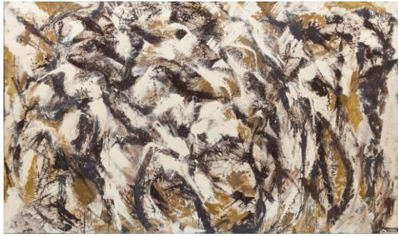
9. Lee Krasner Polar Stampede , 1960 The Doris and Donald Fisher Collection at the San Francisco Museum of Modern Art.