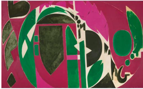
15. Lee Krasner Palingenesis , 1971 Collection Pollock-Krasner Foundation.