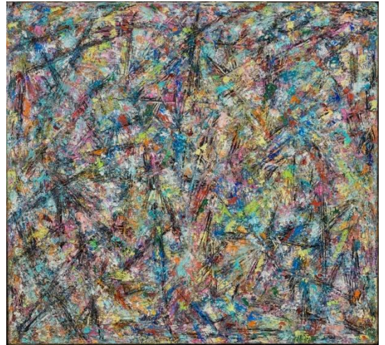
2. Lee Krasner