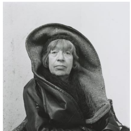
20. Photograph by Irving Penn Lee Krasner, Springs, NY, 1972 © The Irving Penn Foundation