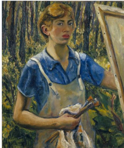
1. Lee Krasner