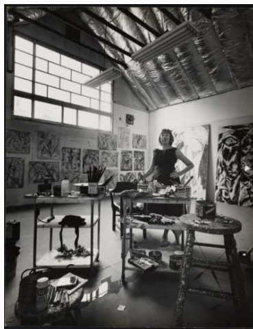
19. Lee Krasner in her studio in the barn, Springs, 1962 Lee Krasner Papers, Archives of American Art, Smithsonian Institution, Washington, D.C.