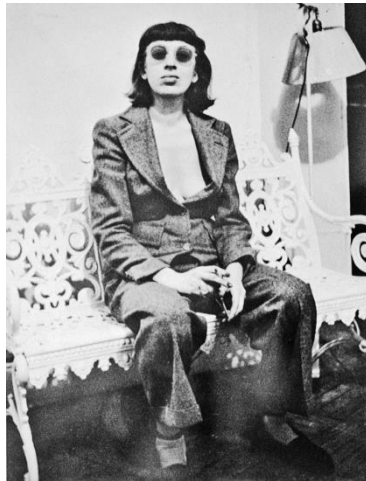
17. Lee Krasner c.1938