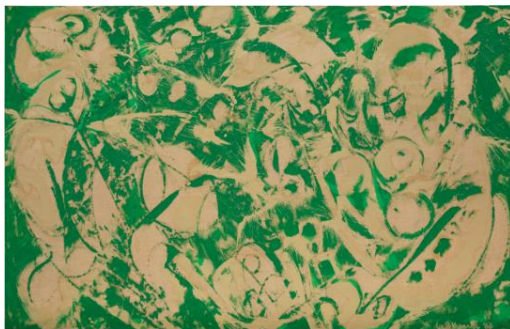
13. Lee Krasner Siren , 1966 Hirshhorn Museum and Sculpture Garden, Smithsonian Institution, Washington D.C. © The Pollock-Krasner Foundation. Photograph by Cathy Carver, Hirshhorn Museum and Sculpture Garden.