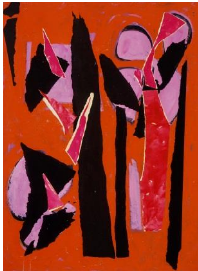
7. Lee Krasner Desert Moon , 1955 Los Angeles County Museum of Art.