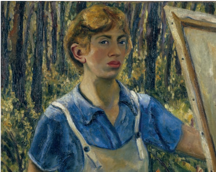
Lee Krasner, Self-Portrait, c. 1928

30 May–1 Sep 2019, Barbican Art Gallery barbican.org.uk/leekrasner