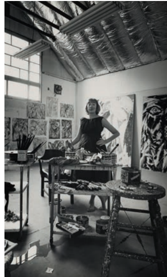
Lee Krasner in her studio in the barn, Springs, 1962

Guggenheim to buy a run-down clapboard farmhouse. Krasner worked in the living room and then an upstairs bedroom – intimate make-shift studio spaces, which are mirrored in the Barbican Art Gallery's upstairs rooms – while Pollock worked in a converted barn outside. After Pollock's early death in a car crash in 1956, Krasner made the courageous decision to claim his studio as her own, which allowed her to work for the first time on large, unstretched canvas tacked to the wall. The result would be the remarkable 'Umber' and 'Primary' series paintings, in which her exploration of scale, biomorphic form and colour collided into some of her most celebrated work.