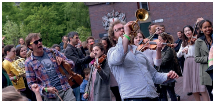
Street Orchestra of London perform at Sound Unbound 2017

A free music festival where over 800 years of music and architecture collide. Find out more at barbican.org.uk/soundunbound