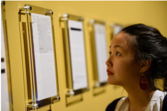
17. Daria Martin: Tonight the World Installation View The Curve, Barbican 31 January – 7 April 2019