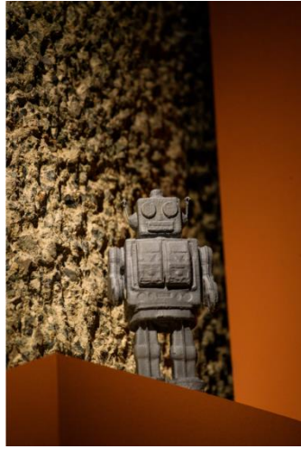
7. Daria Martin: Tonight the World Installation View The Curve, Barbican 31 January – 7 April 2019