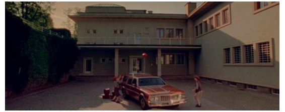
10. Daria Martin Tonight the World , 2019 anamorphic 16mm film transferred to HD 13.5 minutes © Daria Martin, courtesy Maureen Paley, London