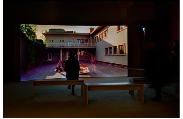
8. Daria Martin: Tonight the World Installation View The Curve, Barbican 31 January – 7 April 2019