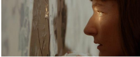
13. Daria Martin Tonight the World, 2019 anamorphic 16mm film transferred to HD 13.5 minutes © Daria Martin, courtesy Maureen Paley, London