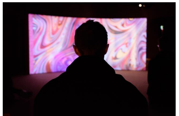
12. Daria Martin: Tonight the World Installation View The Curve, Barbican 31 January – 7 April 2019