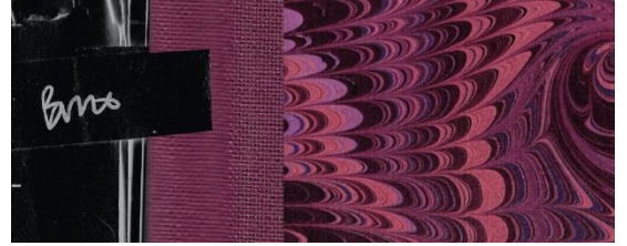
14. Daria Martin Tonight the World, 2019 anamorphic 16mm film transferred to HD 13.5 minutes © Daria Martin, courtesy Maureen Paley, London