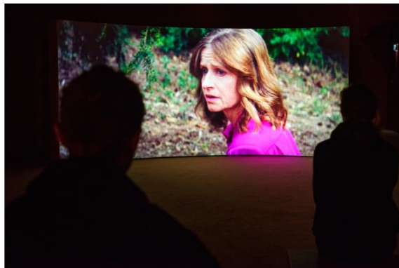
11. Daria Martin: Tonight the World Installation View The Curve, Barbican 31 January – 7 April 2019