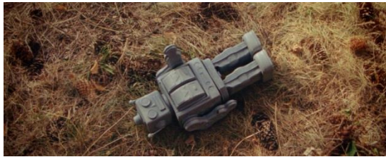
9. Daria Martin Tonight the World , 2019 anamorphic 16mm film transferred to HD 13.5 minutes