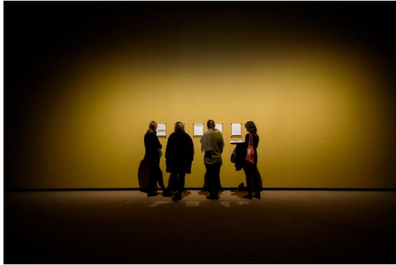
15. Daria Martin: Tonight the World Installation View The Curve, Barbican 31 January – 7 April 2019