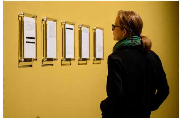
16. Daria Martin: Tonight the World Installation View The Curve, Barbican 31 January – 7 April 2019