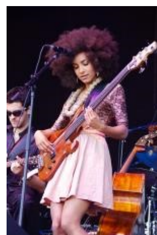
Esperanza Spalding © Brian O'Connor

Built 150 years ago the Holborn Viaduct transformed neighbourhoods and revolutionised City access. Here, in the Barbican on the eve of World Town Planning Day, planner Lester Hillman will explore how the Viaduct solved millennia-old Fleet River problems. The richly illustrated presentation will uncover the forgotten landscape of London Fen, Heavy Hill, the Hollow Bourne, Faggeswelle Brooke and ancient military causeways. Today the newly restored Viaduct, glinting in the sun, offers a portal to the proposed new Museum of London and the arrival of Crossrail brings a whole new dimension to the City's emerging 'Cultural Mile'. Free no need to book.