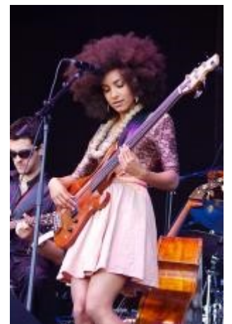
Esperanza Spalding

A musical and social survey of the rich contribution women have made to jazz over the last 100 years, and of the talented upcoming generation who herald an exciting new era. The exhibition pays particular attention to instrumentalists. While many vocalists such as Ella, Billie, Nina and Cleo are household names, many star players and pioneers have been sadly neglected and deserve to be rediscovered. Drawing on the rich resources of the National Jazz Archive the exhibition includes photos, posters, journals, video and memorabilia.