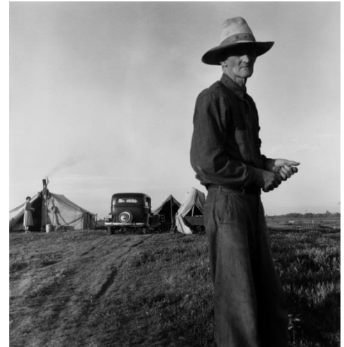
4. Dorothea Lange Drought Refugees, ca. 1935