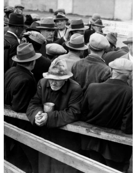
2. Dorothea Lange White Angel Breadline, San Francisco, 1933