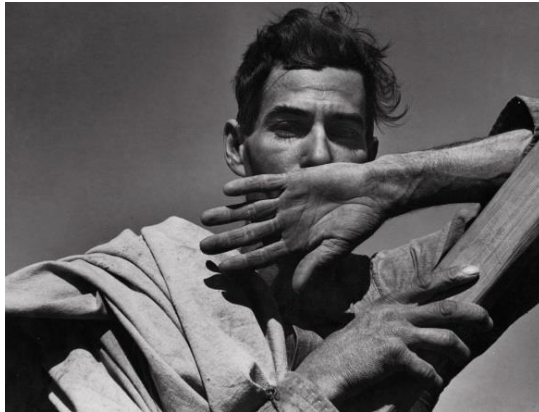
3. Dorothea Lange Migratory Cotton Picker, Eloy, Arizona, 1940