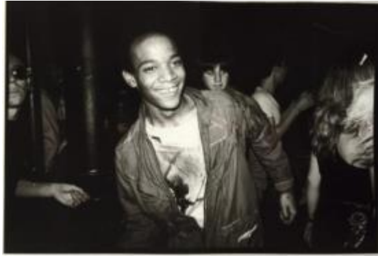
11. Jean-Michel Basquiat dancing at the Mudd Club, 1979.