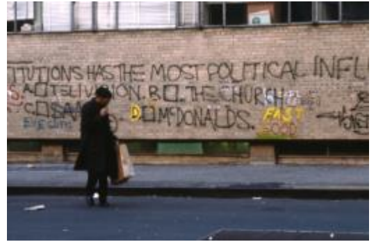
12. 'THESE INSTITUTIONS HAS THE MOST POLITICAL INFLUENCE A. TELEVISION B. THE CHURCH C. SAMO D. MC DONALDS', Jean-Michel Basquiat on the set of Downtown 81. By permission of The Estate of Jean-Michel Basquiat.