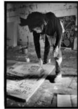
14. Jean-Michel Basquiat painting, 1983 © Roland Hagenberg