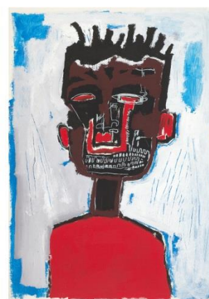
8. Jean-Michel Basquiat Self Portrait , 1984 Private collection. © The Estate of Jean-Michel Basquiat. Licensed by Artestar, New York.