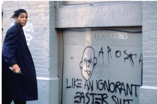
13. 'LIKE AN IGNORANT EASTER SUIT', Jean-Michel Basquiat on the set of Downtown 81. © New York Beat Film LLC. By permission of The Estate of Jean-Michel Basquiat. Photo: Edo Bertoglio