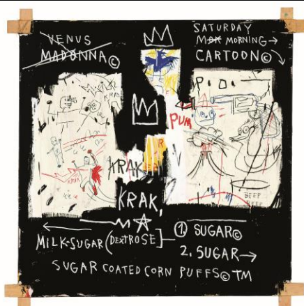
5. Jean-Michel Basquiat A Panel of Experts , 1982 Courtesy The Montreal Museum of Fine Arts. © The Estate of Jean-Michel Basquiat. Licensed by Artestar, New York. Photo: MFA, Douglas M. Parker