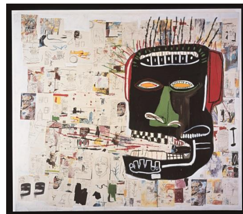
6. Jean-Michel Basquiat Glenn, 1984 Private collection.