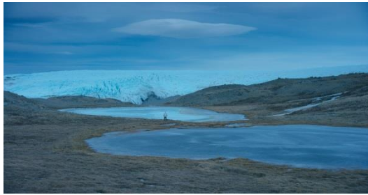
15. John Akomfrah Still frame from Purple , 2017. Six screen film installation by John Akomfrah.