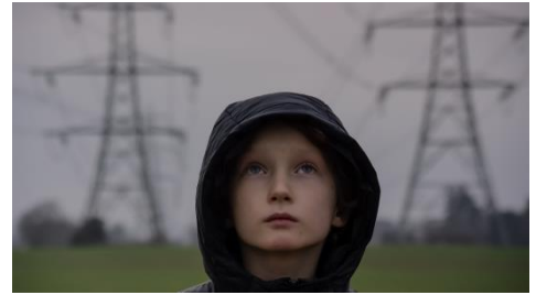
14. John Akomfrah Still frame from Purple , 2017. Six screen film installation by John Akomfrah.