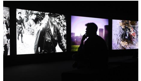
4. John Akomfrah: Purple Installation View The Curve, Barbican Centre, 06 October 2017 – 07 January 2018