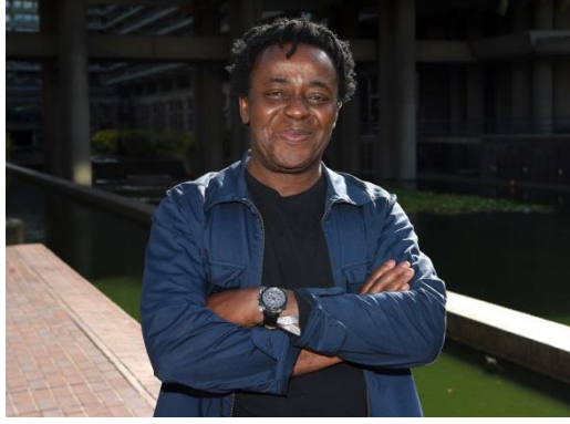
19. Portrait of John Akomfrah Purple , The Curve, Barbican Centre, 06 October 2017 – 07 January 2018