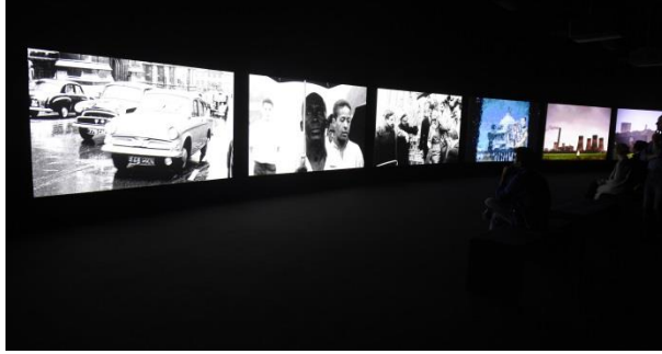
1. John Akomfrah: Purple Installation View The Curve, Barbican Centre, 06 October 2017 – 07 January 2018

Please download images from Dropbox following this link: http://tinyurl.com/PurpleInstall