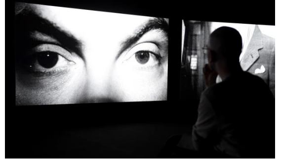
2. John Akomfrah: Purple Installation View The Curve, Barbican Centre, 06 October 2017 – 07 January 2018