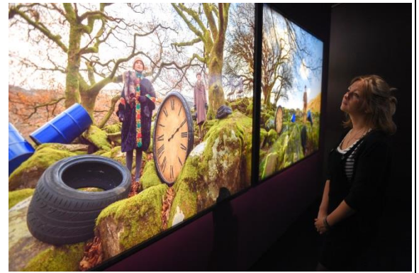
10. John Akomfrah: Purple Installation View The Curve, Barbican Centre, 06 October 2017 – 07 January 2018