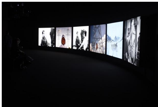
5. John Akomfrah: Purple Installation View The Curve, Barbican Centre, 06 October 2017 – 07 January 2018