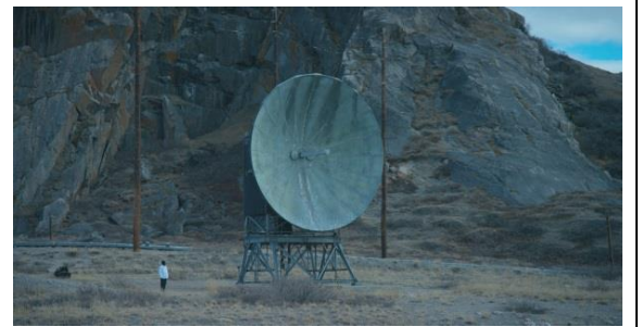
12. John Akomfrah Still frame from Purple , 2017. Six screen film installation by John Akomfrah. © Smoking Dogs Films; Courtesy Lisson Gallery