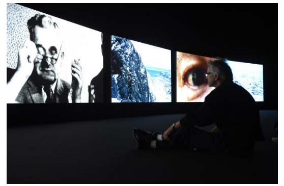
6. John Akomfrah: Purple Installation View The Curve, Barbican Centre, 06 October 2017 – 07 January 2018