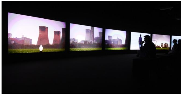
3. John Akomfrah: Purple Installation View The Curve, Barbican Centre, 06 October 2017 – 07 January 2018