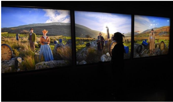
9. John Akomfrah: Purple Installation View The Curve, Barbican Centre, 06 October 2017 – 07 January 2018