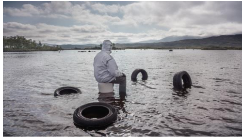
13. John Akomfrah Still frame from Purple , 2017. Six screen film installation by John Akomfrah.