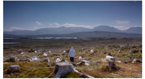
16. John Akomfrah Still frame from Purple , 2017. Six screen film installation by John Akomfrah.