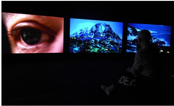
7. John Akomfrah: Purple Installation View The Curve, Barbican Centre, 06 October 2017 – 07 January 2018