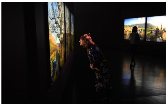
11. John Akomfrah: Purple Installation View The Curve, Barbican Centre, 06 October 2017 – 07 January 2018