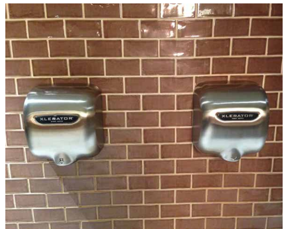
The hand dryers inside the toilets are very powerful and therefore create a lot of noise. We will have paper towels available if you do not wish to use the hand dryers.