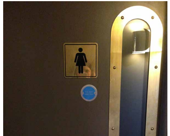
The women's & men's toilets are situated behind the bar by the entrance to Cinema 2.