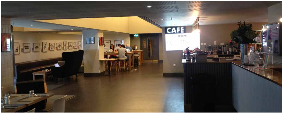
This is a view of the front of the Bar.