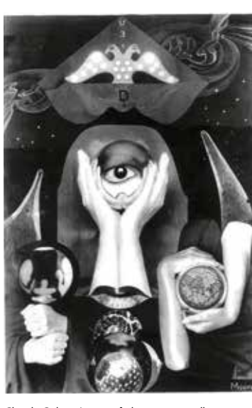
Claude Cahun, Image of photomontage illustration from 'Aveux non Avenus' [Disavowed Confessions], 1930.

https://www.npg.org.uk/whatson/wearing-cahun/home/