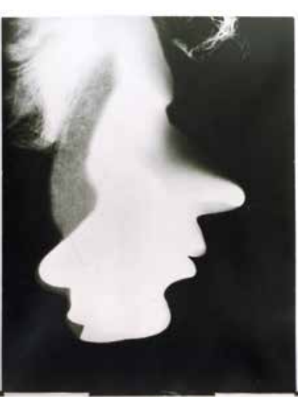
Laszlo Moholy-Nagy, Fotogramm: Double Portrait, (Laszlo and Lucia), 1922-6. Victoria and Albert Museum, London.