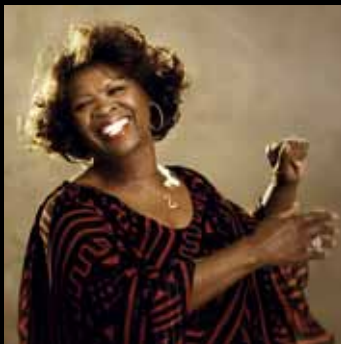
Irma Thomas

Download onto your mp3 player from barbican.org.uk/micachu before you come to the Barbican