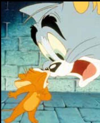
Tom & Jerry © 1992 Turner Entertainment