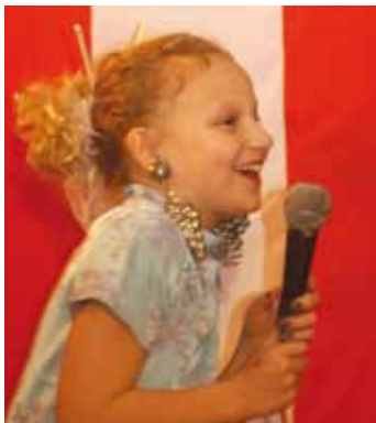
Frank Chickens – Karaoke

Dreamers unite! Join a makeshift world where your imagination is the only limit to the experience as Strangeworks welcomes you To Sleep Perchance to Dream , an interactive performance that takes place between a strange pop-up café and a bed.