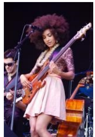
Esperanza Spalding

Do you need help accessing and downloading eBooks, eAudio books or eMagazines? Why not come along to our eResources Workshop where staff will be on hand to help. If you have a mobile device bring it along or watch a demo on one of our computers. Booking essential, ask for more details at the enquiry desk. This workshop is part of Get Online Week, if you need help getting online please book a 1:1 session at the enquiry desk.