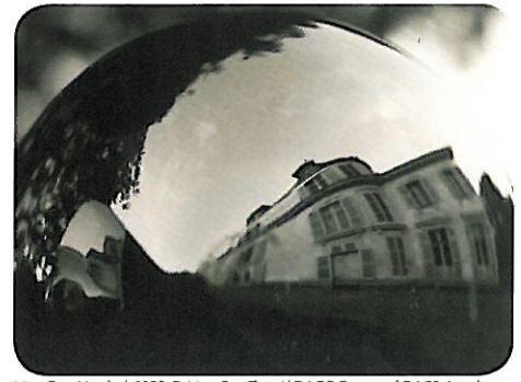
Man Ray, Untitled, 1920

As part of our Barbican Weekender Festival on 24 and 25 July, the Centre will be hosting Dot Comedy's 'Get Lost' on the Lakeside Terrace. A portable, life-size maze, Get Lost has toured to many other outdoor festivals across the UK and abroad. Inspired by fairytale, myth and the Barbican Art Gallery's summer exhibition, The Surreal House , the maze will be populated by