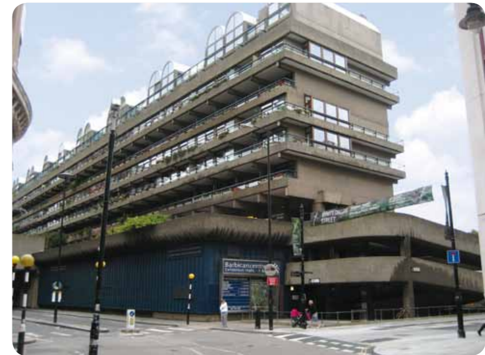
Exhibition Hall 1 as it currently looks

You can email comments to consultation@barbican.org.uk . All of these will be read by us and responses regularly posted on the Residents page of the Barbican website ( www.barbican.org.uk/residents ) and the most frequently asked questions will be featured in future editions of Podium.