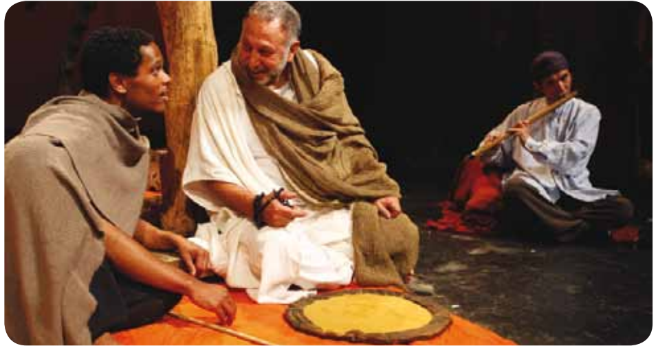
11 & 12 Peter Brook – C.I.C.T./ Théâtre des Bouffes du Nord

To plan your fun days over the weekend visit www.barbican.org.uk/different