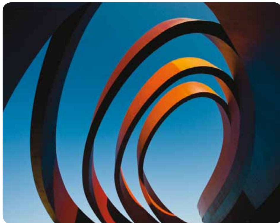
Ron Arad Architects, Design Museum Holon, Israel, 2004–09.