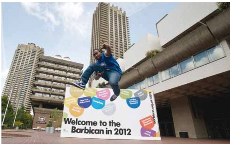
24th May launch