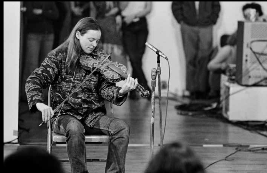
Laurie Anderson performing How to Yodel in Soup and Tart, The Kitchen, New York, 1974