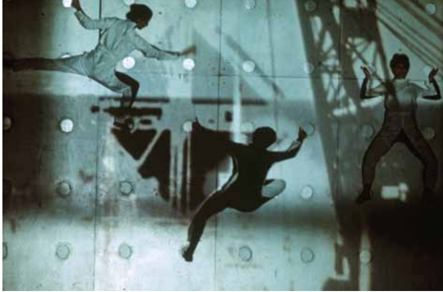
Trisha Brown , Planes , 1968