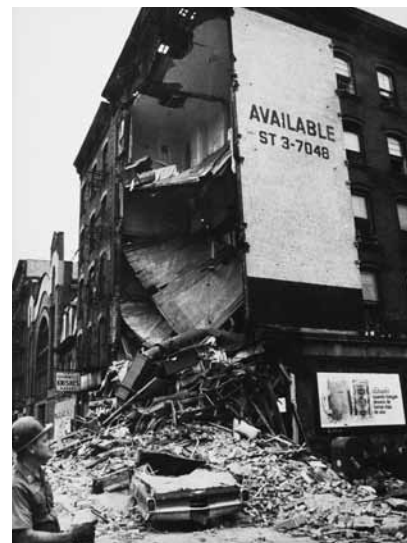
Gordon Matta-Clark, Anarchitecture, 1974