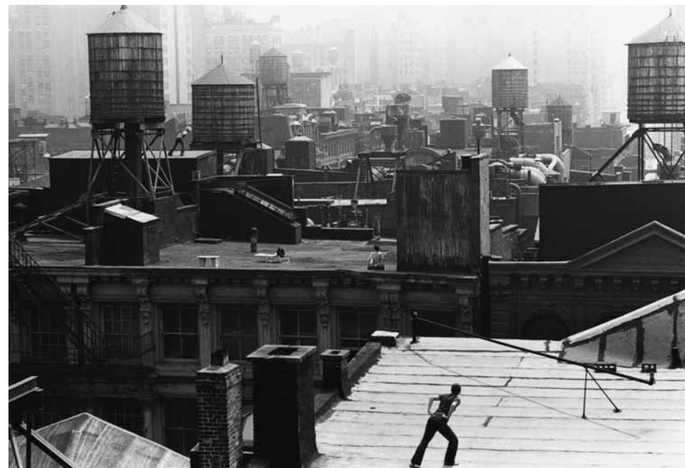
Trisha Brown, Roof Piece , 1973

On Thursday evenings, the Gallery opens late until 10pm with a fantastic line up of talks, performances, dinners and other events that draw inspiration from the experimental downtown New York art scene of the 1970s. An evening performance of Trisha Brown's Walking on the Wall takes place on Thursdays at 7.30pm. Enjoy a drink with friends at the gallery bar and then watch, listen and join in!