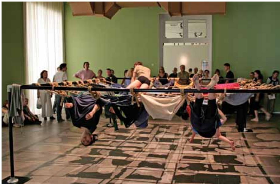
Trisha Brown, Floor of the Forest, 1970. Performance at documenta 12, Kassel, 2007