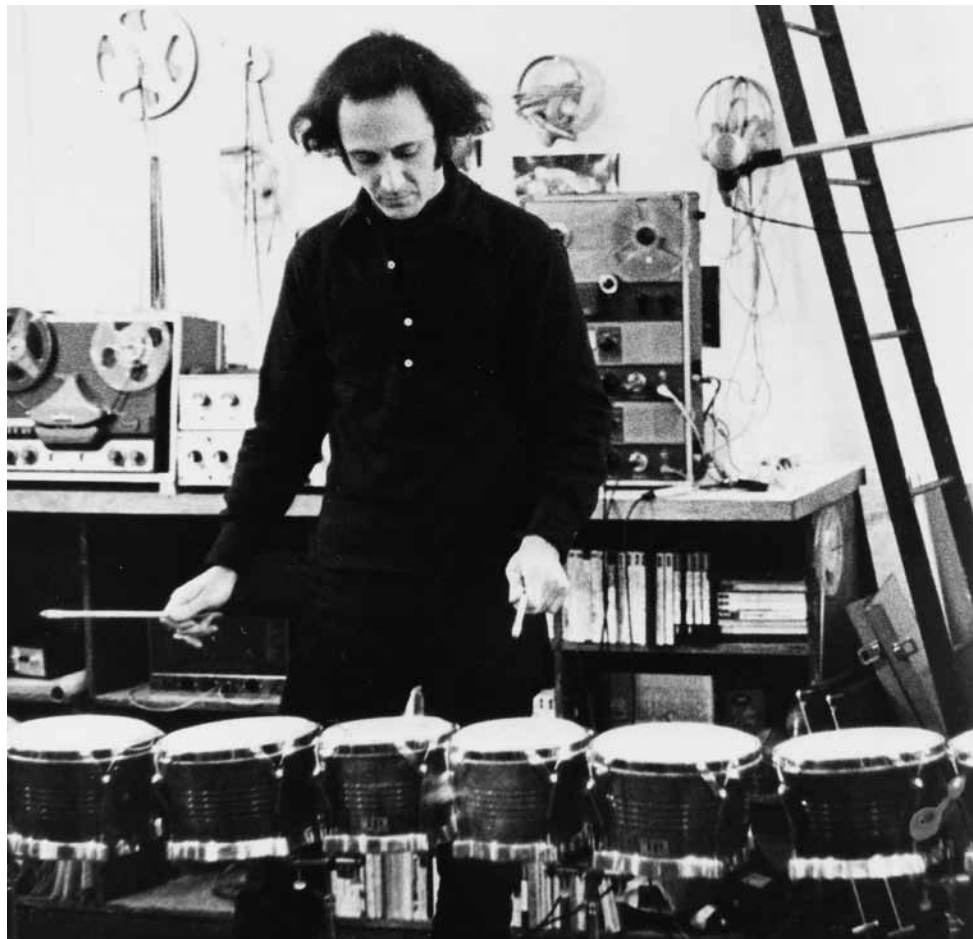
Steve Reich