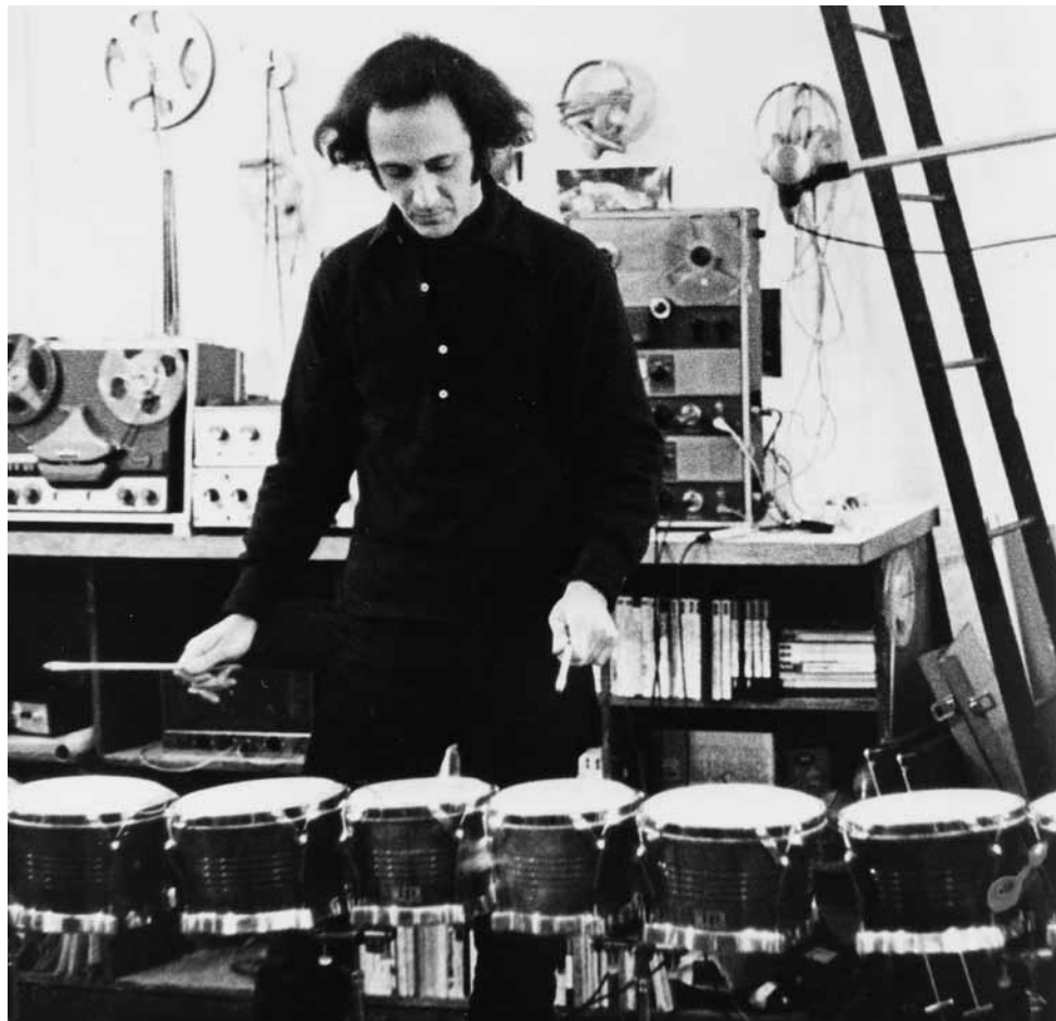
Steve Reich