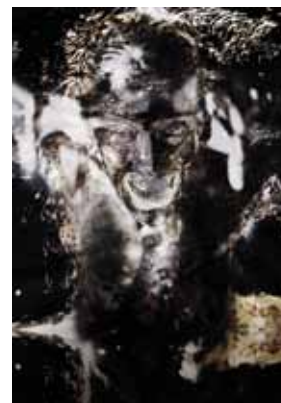
SCHREI 27 © Kristofer Buckle

Ryoji Ikeda's datamatics [ver.2.0] is the latest audiovisual concert in the datamatics series, an art project that explores the potential to perceive the invisible multi-substance of data that permeates our world. Using pure data as a source for sound and visuals, datamatics combines abstract and mimetic presentations of matter, time and space in this powerful and breathtakingly accomplished work. Produced by Forma.