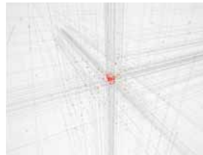
datamatics [ver.2.0] © Ryuichi Manio. Courtesy YCAM