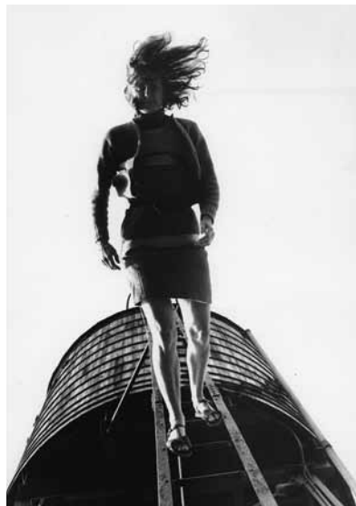
Trisha Brown , Woman Walking Down a Ladder (detail), 1973