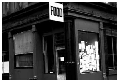
Exterior of Food after renovations, 1971–72