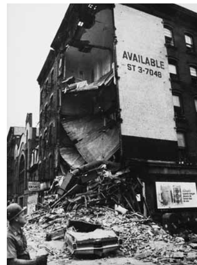
Gordon Matta-Clark, Anarchitecture, 1974

Art historian Briony Fer explores the work of Gordon Matta-Clark and Trisha Brown.