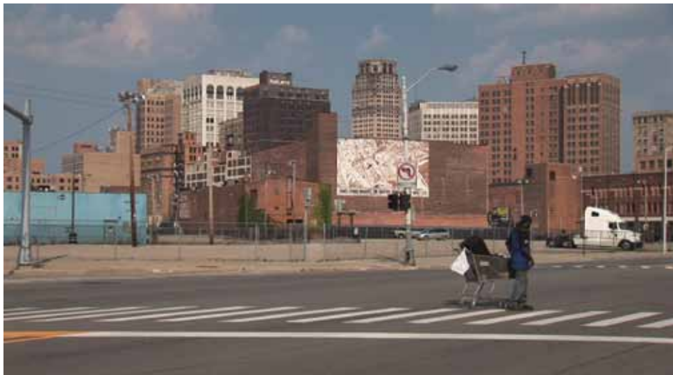
Detroit Wild City , Architecture on Film

To complement the exhibition, Barbican Film presents a series of films exploring the challenging boundaries between dance, film and visual art from the 1970s to today. All films will be screened in Cinema 1.