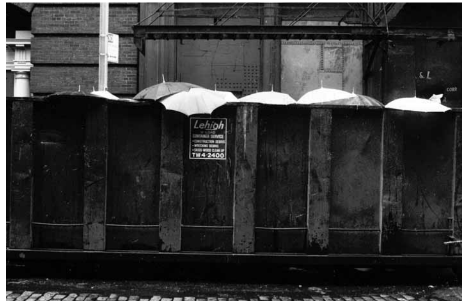
Gordon Matta-Clark, Open House, 1972