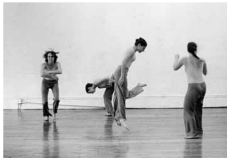
Trisha Brown, Locus , 1975