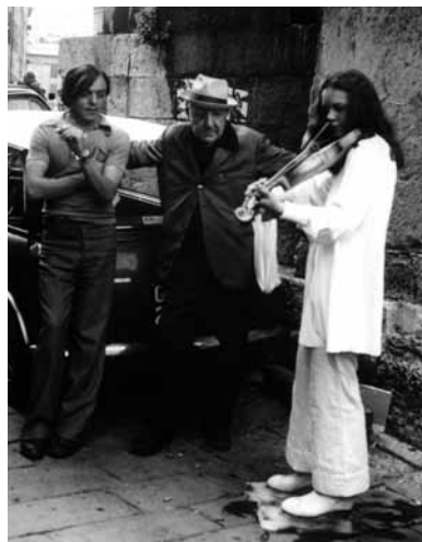
Laurie Anderson, Duets on Ice, Genoa, Italy, 1974–75 Courtesy the artist and Sean Kelly Gallery, New York.

All events take place in Barbican Art Gallery unless otherwise indicated here. Admission to the Gallery is £8 online/£10 on the door. Some events are separately ticketed. To avoid disappointment please book in advance for all events.