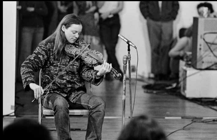
Laurie Anderson performing How to Yodel in Soup and Tart , The Kitchen, New York, 1974