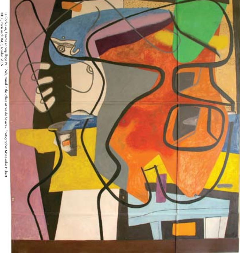
Le Corbusier, Fernand Lévy, 1948, mural in the office of rue de Sévres, Photographer: Maurice-Edlie Hildeit ©FHC, Paris and DACS, London 2009

A film season exploring the legacy of Le Corbusier, from visions of future cityscapes in Vu-topia , to features, documentaries and archive material.