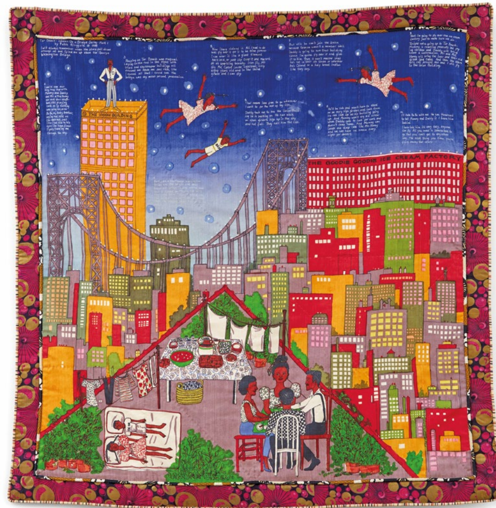
↑ Faith Ringgold, Tar Beach 2 , 1990–1992. © Faith Ringgold / ARS, NY and DACS, London, Courtesy ACA Galleries, New York 2023 and Pippy Houldsworth Gallery, London. Photo: Benjamin Westoby.

Among the artists on display is Judy Chicago, who collaborated with women to embroider powerful and realistic depictions of birth and other images that she felt were missing from Western art history.