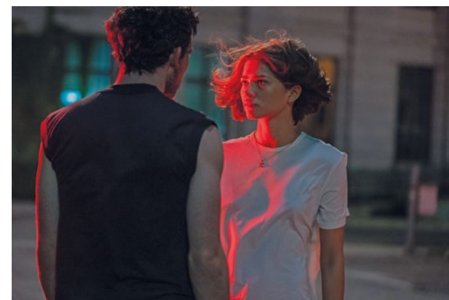
↪ Gay Man's Guide to Safer Sex '97

There are so many more titles out there to enjoy during this period and we can't wait to share them with you.