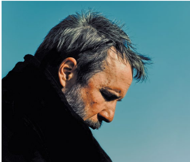
← Denis Villeneuve. ➔ Dune: Part Two